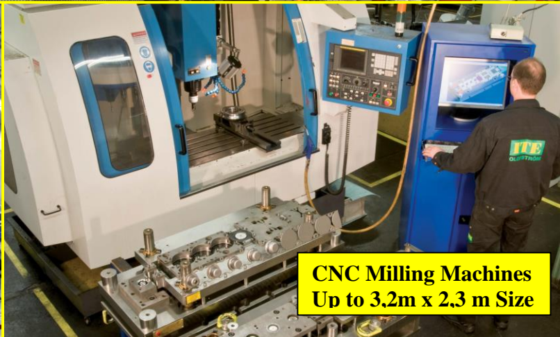
CNC Milling Machines Up to 3,2m x 2,3 m Size