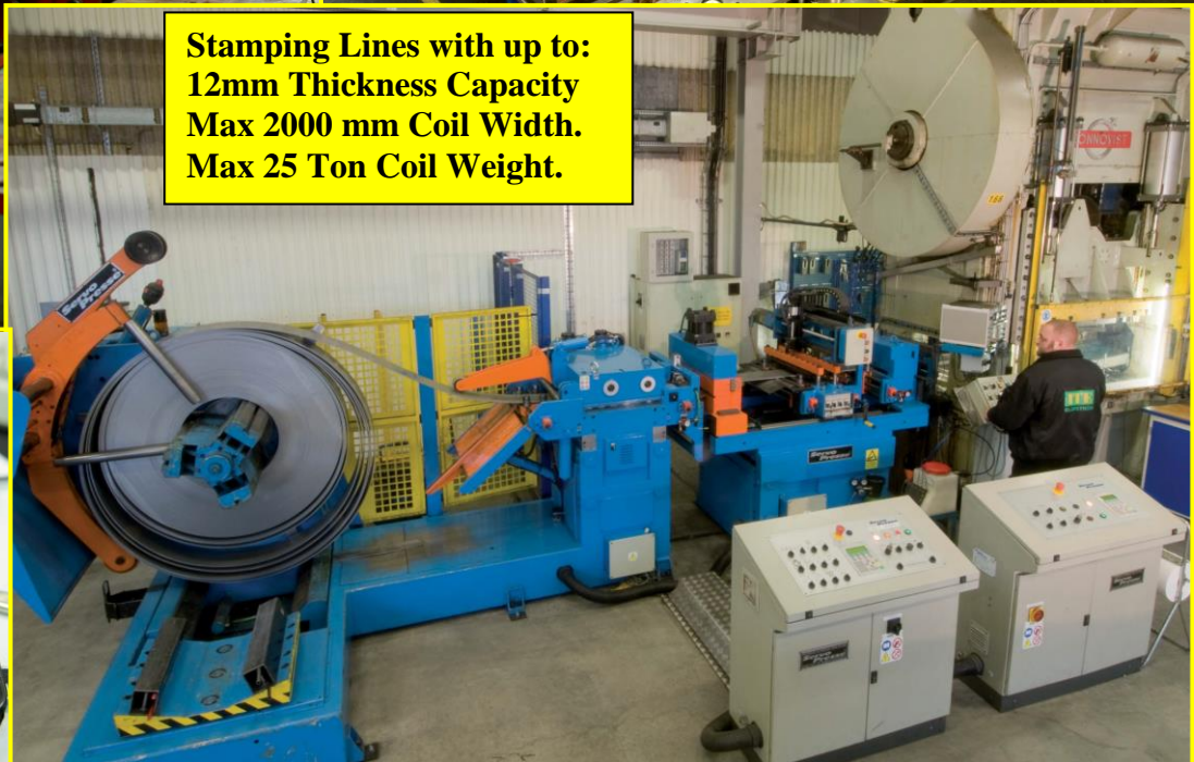
Stamping Lines with up to: 12mm Thickness Capacity Max 2000 mm Coil Width. Max 25 Ton Coil Weight.