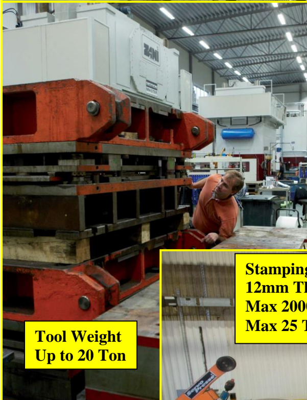
Tool Weight Up to 20 Ton